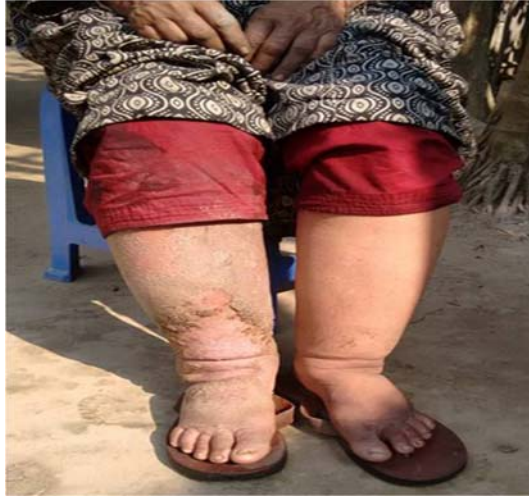
Name: Gofiroon Nessa from Kaliganj sub-district; - Ulceration, - Insect; - Offensive smell